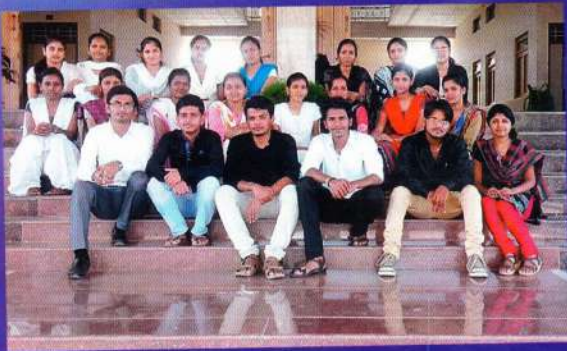
Black and White day